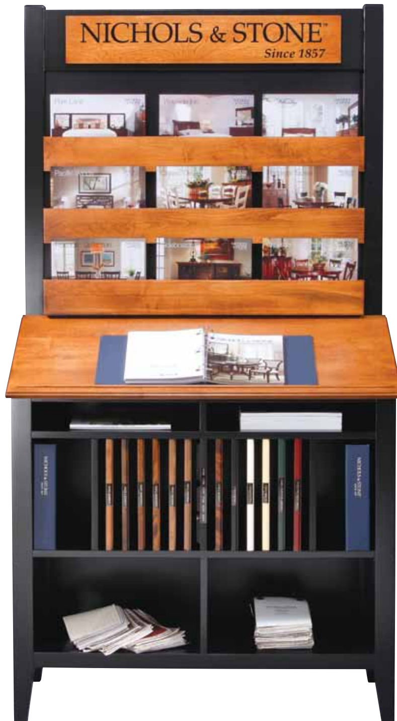
CS-NS13 NICHOLS & STONE DESIGN CENTER H80 W42¾ D18